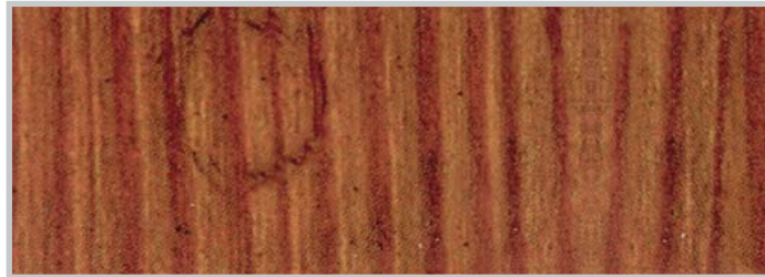
With Care Balsam: Intact surface