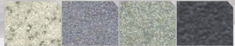
Lilac white (ZY 212)