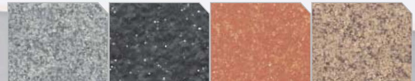
Classic grey (ZY 298)