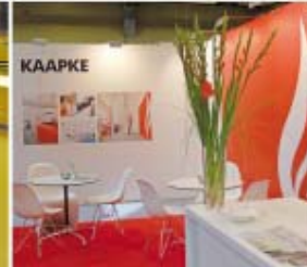
Trade fairs and exhibition areas

Our best exhibit. Even when traces of heavy wear or damage eventually appear, the Zydrit flooring can soon regain its former glory. Simply do the same as with wooden floors. Sand, reseal and it's finished.