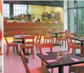
Restaurants and public buildings

Fast service included For use in refurbishment and in new construction: The high-quality Zydrit flooring always gives good service. It can be laid in minimal time.