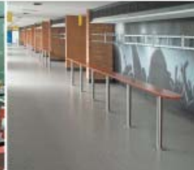
Large areas with heavy public use

For a quality appearance Easy care, chemically and UV resistant: With these properties the high performance Zydrit flooring can always shine in public – every single day.