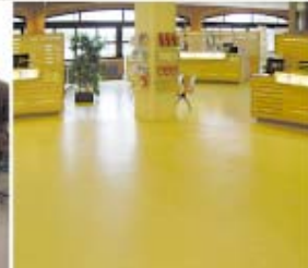
Waiting and reception areas

Despite refurbishment: Minimal service disruption. It is easy and quick to install Zydrit flooring on many substrates – without the time and expense of removing and disposing of the old flooring.